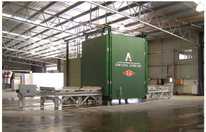
Below picture is guide only of 4 pallet model